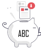
Transfer of Credits